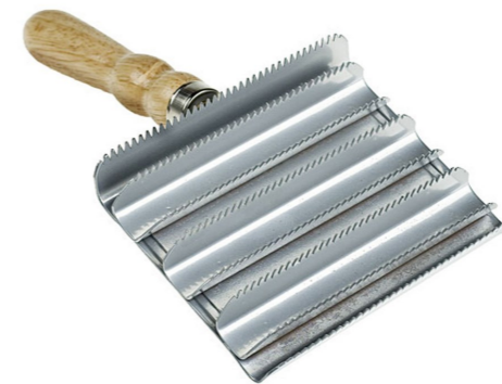
metal curry comb