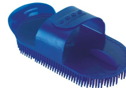
plastic curry comb